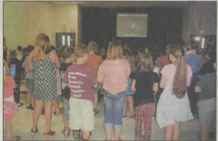
Kindergarten through 4th grade students sing the "Star Spangled Banner."

The lyrics come from "Defence of Fort M'Henry," a poem written on Sept. 14, 1814, by 35-year-old lawyer and amateur poet Francis